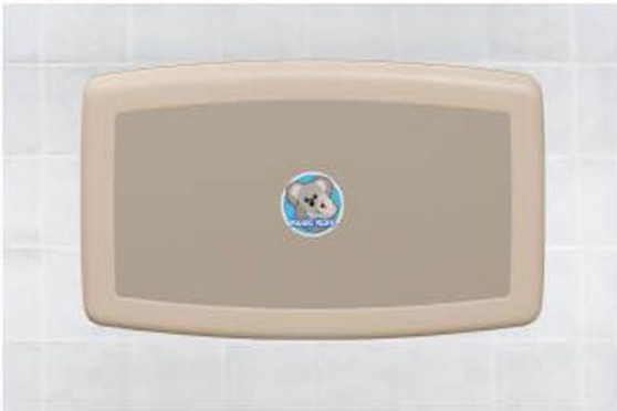
KB300-00 Beige Color