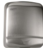
M99ACS Satin finish