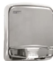
M99AC Bright finish