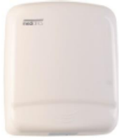
M99A White finish