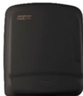
M99AB Matte black finish