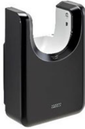
M23AB Black finish