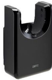
M23ABT All black finish