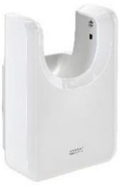
M23A White finish