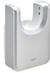
M23ACS Satin finish