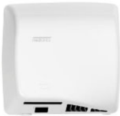
M17A/M17A-I White finish