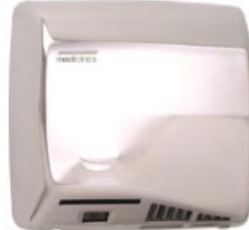
M17AC/M17AC-I Bright finish