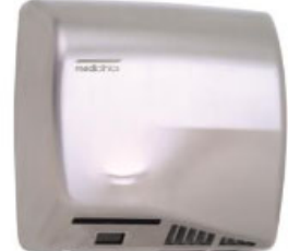
M17ACS/M17ACS-I Satin finish