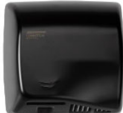
M17AB/M17AB-I Black finish