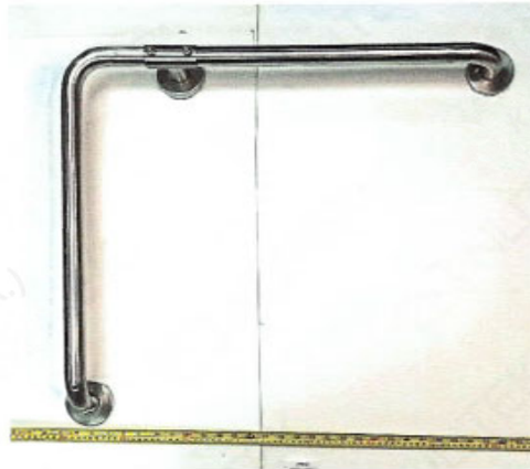
Figure 1 - Sample