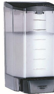
DJ0020F Black finish