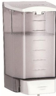
DJ00010F White finish